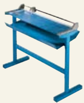
Optional features 00698 Stand