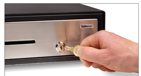
With 3-position lock (locked, stand-by and open)