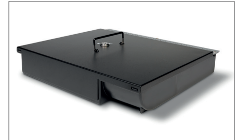
Safescan 4141L Lockable lid Art. no: 132-0432