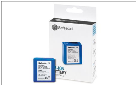
Safescan LB-105 Rechargeable battery Art. no: 112-0410