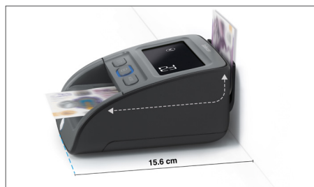
Fits in the smallest workspaces and sales environments thanks to the unique banknote exit guide