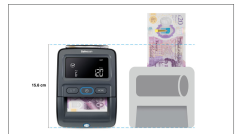
Has one of the smallest operational footprints available compared to other solutions on the market