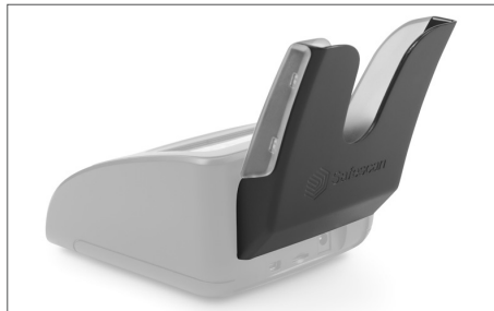
Safescan RS-100 Banknote Stacker Art. no: 112-0695