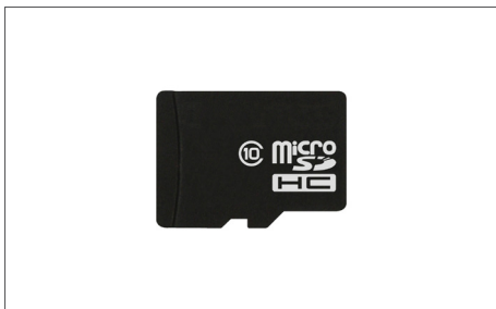
Safescan MicroSD Card Art. no: Various (based on device and currencies)