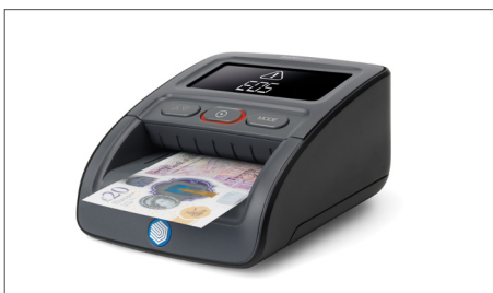
Checks and verifies banknotes on up to seven security features