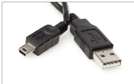
Safescan USB update cable Art. no: 112-0459